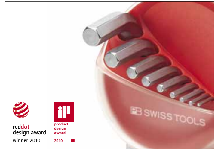
Double award: our KeyDisc tool holder has received an award in two top international design competitions